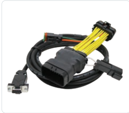
Item Part Number: 75094GT