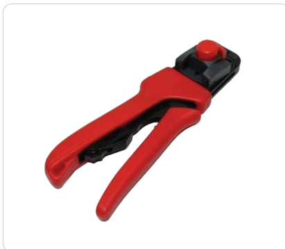
Item Part Number: 56561GT

Benefit – Thumb drive contains Web-GPI, all application files required to communicate with each machine's controllers. Also contains Web-GPI training to assist the user to gain confidence in using the program.