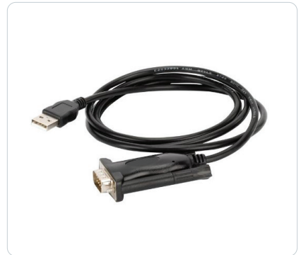
Item Part Number: 1252193GT

Benefit - Crimping tool specifically designed for use with molex pins used on ALC500 and ALC1000 equipment machines.