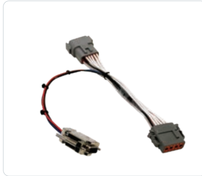
Item Part Number: 107647GT

Model(s): S®-100, S®-105, S®-120, S®-125