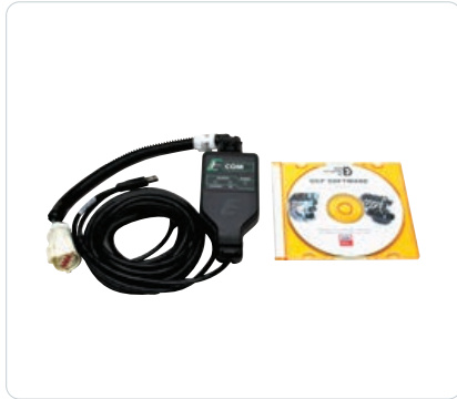
Item Part Number: 70474GT