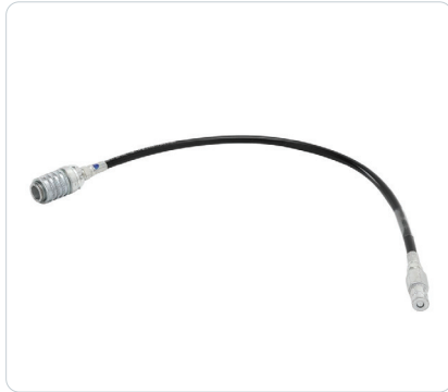
Item Part Number: 93501GT