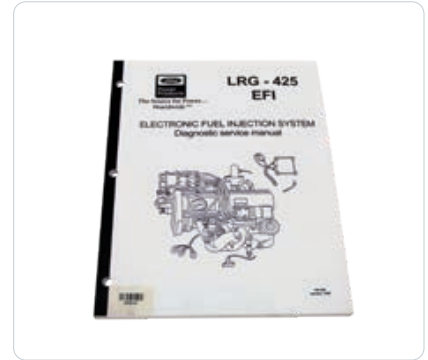
Item Part Number: 65844GT

Model: All with Ford® 2.3 or 2.5 EFI engine