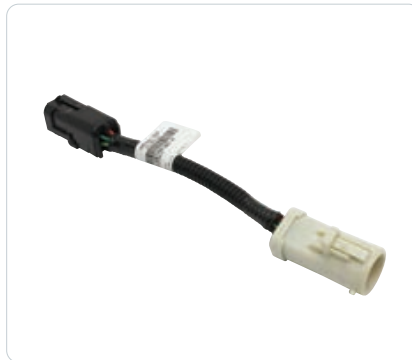
Item Part Number: 119204GT

Model: All with Ford® 2.3 EFI engine Need this cable with part #119204GT to connect to Ford LRG