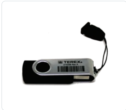
Item Part Number: 215336GT

With DP 200 displays in booms with Tier 4F engines