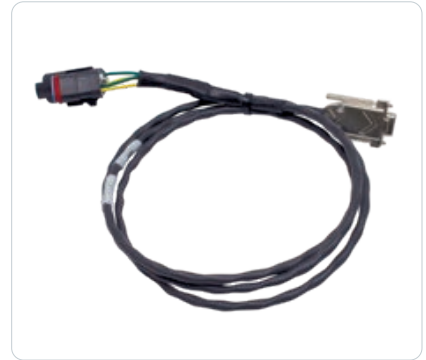
Item Part Number: 110803GT

Machine Models Supported: Z®-135, ZX®-135, All SX™ machines