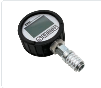
Item Part Number: 93500GT

Model: All Booms and Scissors. *Part of 93500